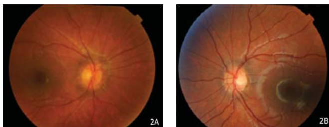
Figure 2A. Retinal examination of right eye revealed normal findings at the first presentation. 2B. Retinal examination of left eye revealed normal findings at the first presentation.

later, the patient returned with a sudden visual loss to light perception in RE. The pupil was still dilated and nonreactive to light. A severe inflammation of the anterior chamber and dense vitreous was detected. Fundus examination limited due to severe vitritis. This inflammation was resistant to anti-inflammatory treatment. The ocular examination of LE disclosed normal findings. An IOFB was noticed at pars plana with cranial CT (Figure 3). There was no sign of an entry site in the eye, iris laceration, or any lenticular capsular perforation. Lens sparing pars plana vitrectomy (PPV) was carried out immediately and a metallic IOFB, with an overall diameter of 0.2x0.1 cm, (Figure 4) was extracted. Sulfur hexafluoride gas was injected at the end of the surgery. Two weeks later, mydriasis disappeared. One month later, retinal re-detachment due to severe proliferative