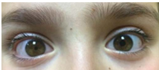
Figure 1. One drop of pilocarpine 1% as well as pilocarpine 0.1% applied in temporally different settings, produced constriction of the right pupil but had no effect on the left pupil. This picture was observed after the instillation of 0.1% of pilocarpine eye drop.

Neuropediatricians took over the patient and followed him for a while. His fever got normalized without any treatment but mydriasis persisted for the next 10 days. Two months