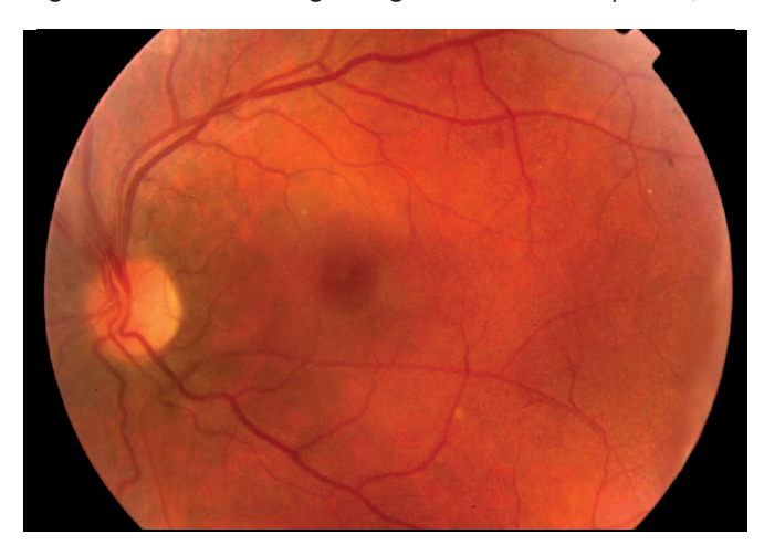
Figure 3: The macula of the left eye at 1 month after TTT. The edema, exudates and serous elevation have resolved. The dilatation and tortuosity of feeder vessels have regressed.

The moderate and large sized RCHs in both eyes were treated with TTT with 810 nm diode laser (IRIS Oculight SLx, IRIS Medical Inc, Mountain View, CA). The laser parameters were adjusted to obtain moderate whitening of each lesion beginning with 800 mW power, 60