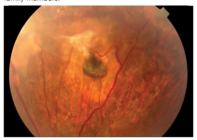
Figure 4: The RCH in figure 1 at 6 months. The tumor scarred totally, dilatation and tortuosity of vessels have regressed. The 532 nm laser photocoagulation provided a firmly attached retinal zone limiting tractional effects.

At 1 month, additional TTT was applied to completely obliterate the large sized RCHs, which were also circumscribed with 532 nm laser photocoagulation. At 6 months, all RCHs had totally scarred without any exudation (Figure 4). Further laser photocoagulation was applied only to new developing RCHs. Although fibrous proliferation developed from scarred large sized RCHs in 6 months, retinal detachment did not occur. At 30 months, the VA in both eyes was preserved. Systemic investigation revealed hemangiomas in the cerebellum and medulla oblongata, syringomyelia, renal cell carcinoma in the right kidney, multiple renal and pancreatic cysts. No sign of disease could be disclosed among the family members.