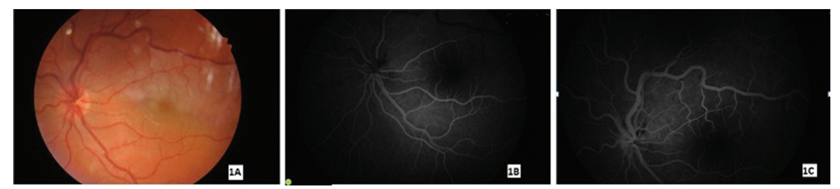
Figure 1: 1A: Increased tortuosity and veneous dilation of retinal vessels and blurred disc magrin particularly temporal side. Retinal whitening of the superior quadrant along the course of a cilioretinal artery (a), Delayed filling of the central retinal vein and prolonged arterivenous fillig time (b), Dye leakage particularly the temporal side of the disc area (c).