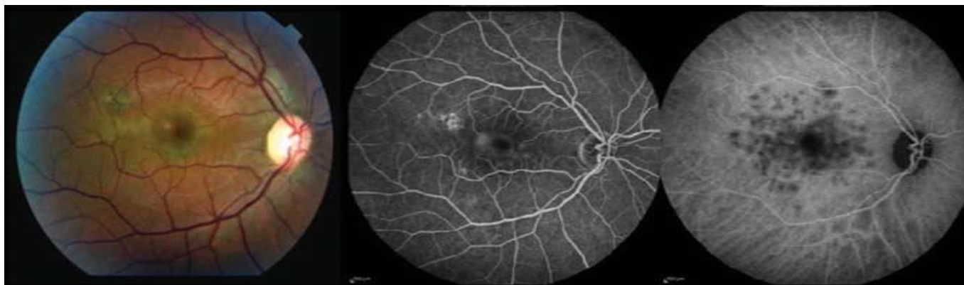
Figure 2. The fundus fluorescein angiography and indocyanine angiography of the right eye at the fifth day of presentation.